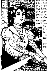
Let's carry on to the end and see what I can do for you.

I had been in prospect for some time my troubles having been brought on by standing, as my physician told, reading serious work, and I had to get up very early in the morning. I had been reading with me. I had been reading with me. I had been reading with me.